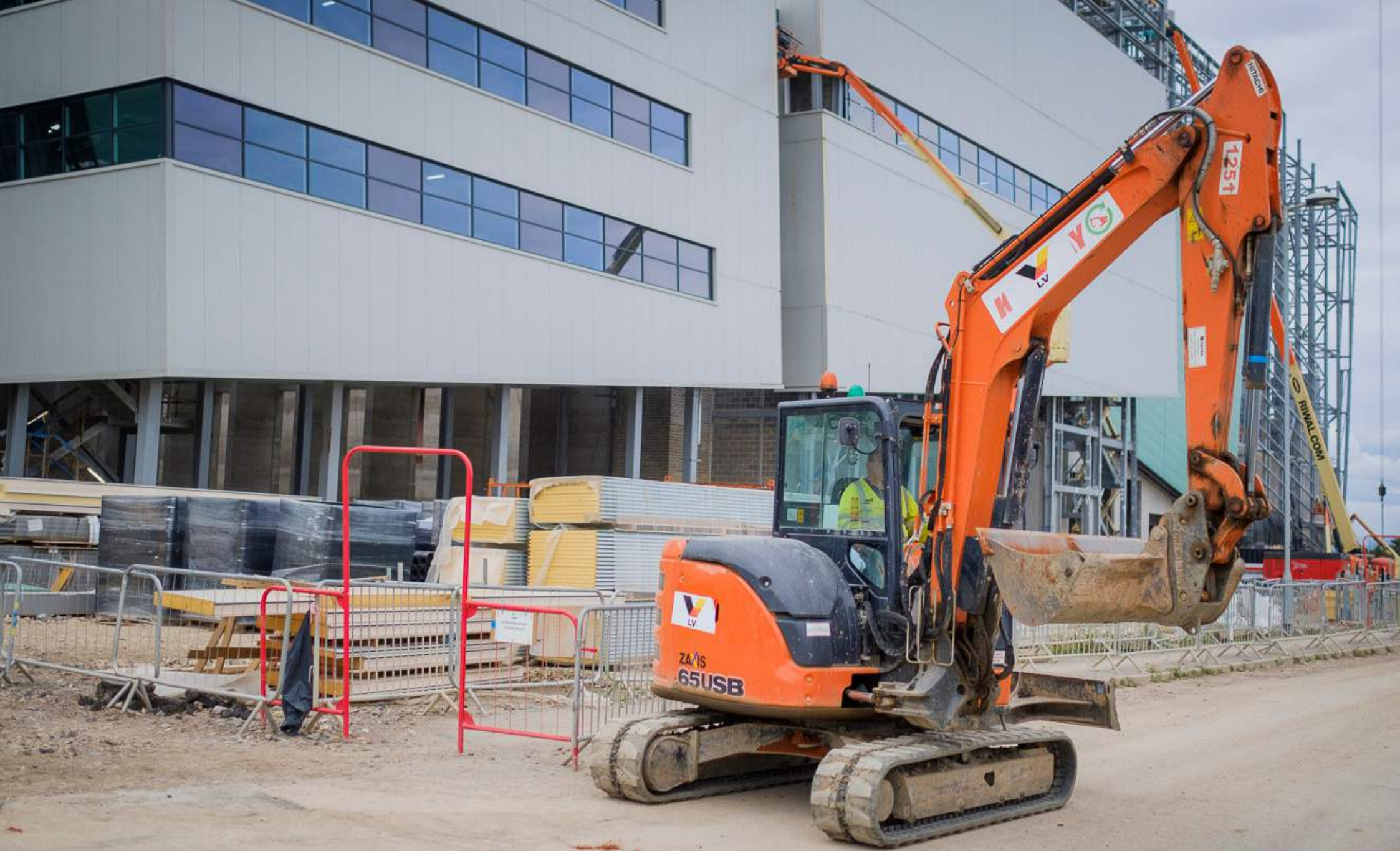
Javelin Park Energy Recovery Centre, Gloucester.